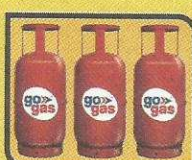
Packed Cylinder Marketing